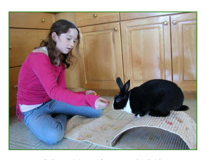
Clicker training with Oreo on his bridge.

Jump! Spin! Come when you call – YES you can train your rabbit to do these things and beyond. More than just wriggling noses and long ears, rabbits go way beyond cute and are intelligent fun-loving pets.