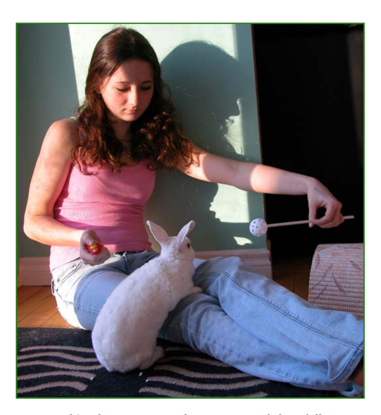
Teaching bunny to "touch a target" and then follow.

Favorite Treats: Raisins (max 3 per day), Carrots (max 3 inches per day), Romaine lettuce, Dandelion leaves, Parsley, Timothy hay pellets, Banana (max 1 inch per day), Apple (max 10 bites per day)