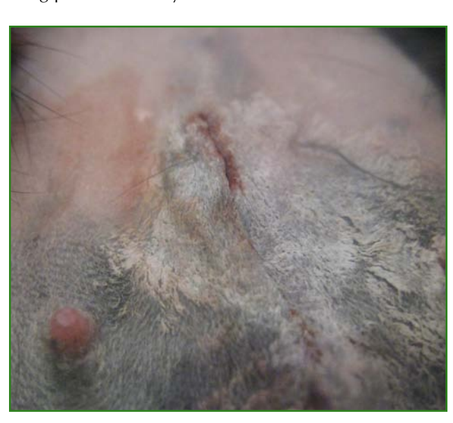
This is what a typical bunny spay incision site looks like.

which we named her Harlett and she learned the value of a larger living space with an increased habitat size, about her very speedy two day learning curve of litter habits and the true value of a diet not consisting of dog food, but rather fresh timothy hay, timothy-based pellets and leafy greens, with a few fruity treats every night. All of that is for the rabbits to read and enjoy. No doubt what all of you rabbit owners may want to read about is what WE