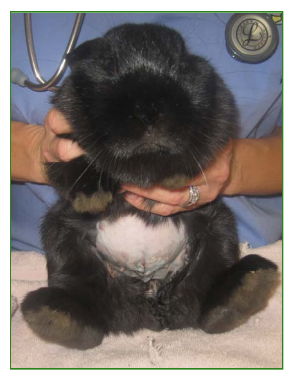
"Wuji", a bunny that recently came into HRN foster care. This is what her belly looks like right after a spay surgery.

on the post-op care instructions of a spayed rabbit, but I definitely wanted to clarify the necessity of pain medications and the alarming situations that can occur, such as refusal to eat, and ripped-out stitches.