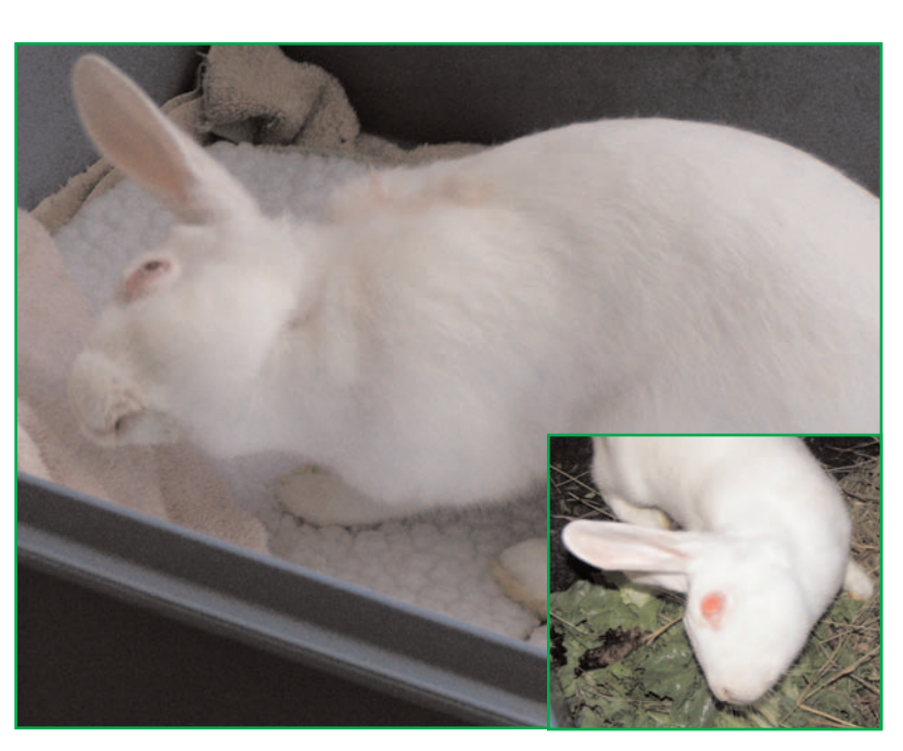
Brady had severe head tilt (about 90 degrees), but after proper diagnosis and medications, he recovered with only a slight tilt.

A second common cause of head tilt in rabbits is Encephalitozoon cuniculi, also known as E. cuniculi. E. cuniculi is a microscopic parasite that usually affects nervous tissue, the lens of the eyes, and the kidneys. Rabbits can become infected through exposure from the urine of infected animals or through the placenta.