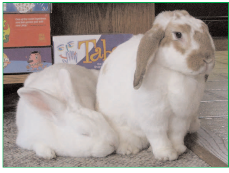
Snugs and her boyfriend, Radar. She's living the good life now!

her spine was. She had a thick dewlap under her neck and she also had extra skin/fat around her hips/ back (due to being overweight at one point in time). The fur around her eyes was stiff and frozen.