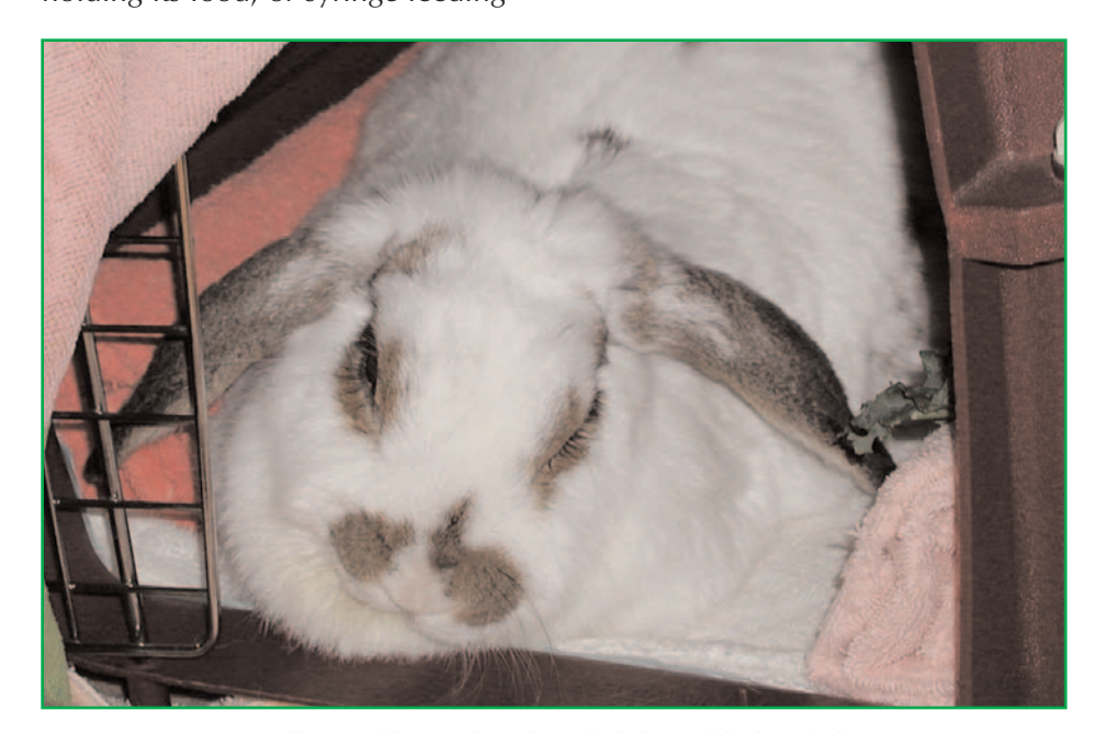
Belle, a rabbit with only a slightly visible head tilt.

The prognosis for a rabbit with a head tilt is variable and difficult to predict. Rabbits that are depressed and are