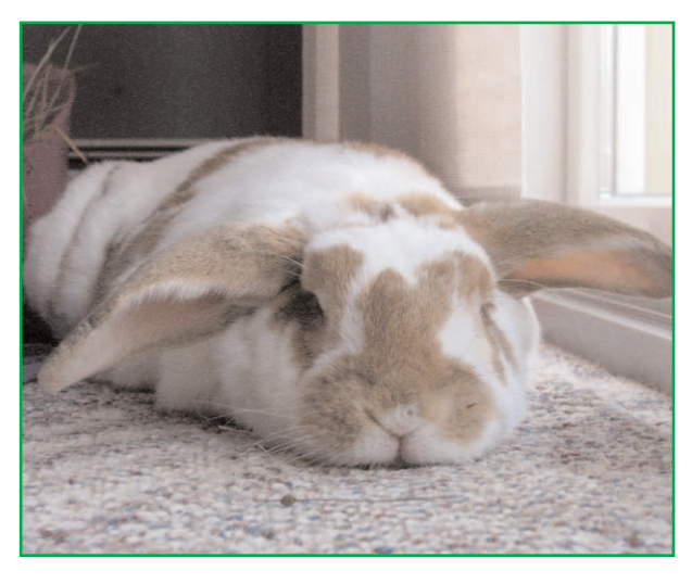
Snuggles, rescued from a cold, solitary confinement.

That evening, after I got out of work, I went home, changed into my jeans and packed a bag of hay. I drove to the house and it was dark. There was no front light on, but there were three cars in the driveway. I took my chances. I pulled up in front of the house and parked in the driveway. I walked up the front steps and