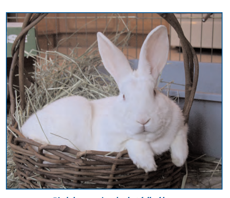
Birch lounges in a basket full of hay.

My beautiful bunny Birch, a redeyed white bunny, has only three legs. He may not be the pick of the warren for many adopters, but I would not trade him for the world. I fell in love the minute I saw him!